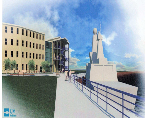
An architectural rendering of the USS Canon in its proposed berthing site. A refurbished Koepsell Building is shown in the background.

When it comes to historic naval ships, the USS Canon is no slouch! She deployed to Vietnam in 1971 and fought two important river battles that year against ambushing enemy forces. In the battles, the Canon received multiple hits from shore fire and was seriously damaged, but her crew fought courageously, saved the ship and inflicted heavy casualties on the attacking forces. As a result of these actions, her crew of around 30 members were awarded three Silver Stars, five Bronze Stars and numerous purple hearts for their heroic efforts! The USS Canon definitely qualifies as a historic naval ship and she is a treasure worth pursuing! To make her pursuit even more attractive, after she is awarded to WINSA, the organization will seek “National Register of Historic Places” recognition for the USS Canon!